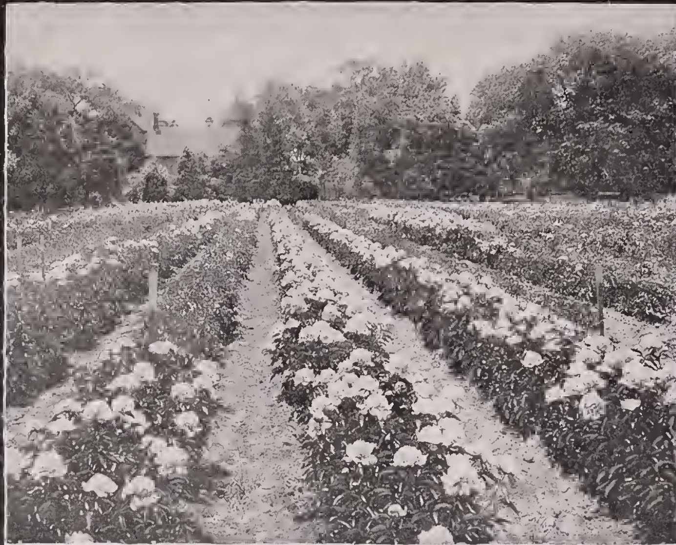
A BLOCK OF PEONIES IN OUR NURSERY